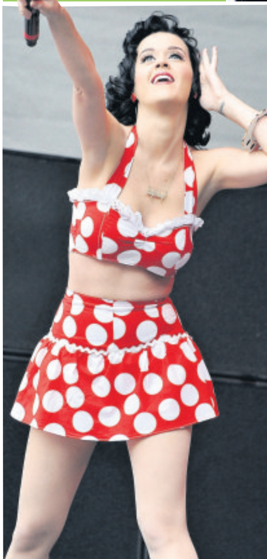
AMERICAN singing sensation Katy Perry performed alongside chart stars such as Leona Lewis, Lionel Richie, James Morrison, Enrique Iglesias and Dizzee Rascal when more than 55,000 pop fans flocked to Capital FM's Summertime Ball at Arsenal's Emirates Stadium in Holloway on Sunday.

Capital DJ and concert host Johnny Vaughan said: "I loved every minute. I think all of that dancing has worn me out for my breakfast show!"