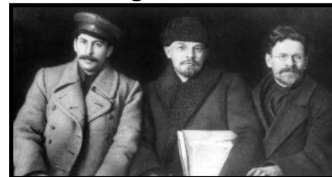
Joseph Stalin, Vladimir Lenin and Mikhail Kalinin, 1919